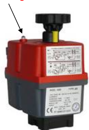
J3 -H55 Electric rotary actuator