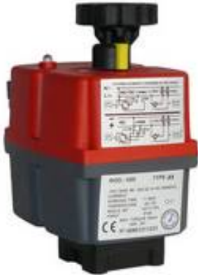
The J3 - H55 electric rotary actuator

Visual indication of the actuator's operating status is constantly shown by a highly visible LED light.