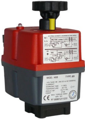
The J3 - L55 electric rotary actuator

Visual indication of the actuator's operating status is constantly shown by a highly visible LED light.