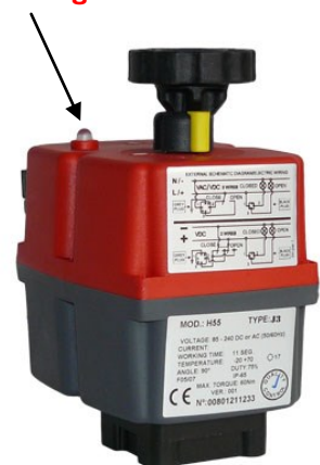
J3 Electric rotary actuator