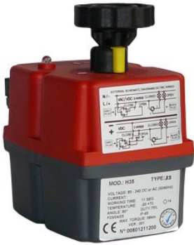
The J3 - 35 quarter turn electric valve actuator

Visual indication of the actuator's operating status is constantly shown by a highly visible LED light.